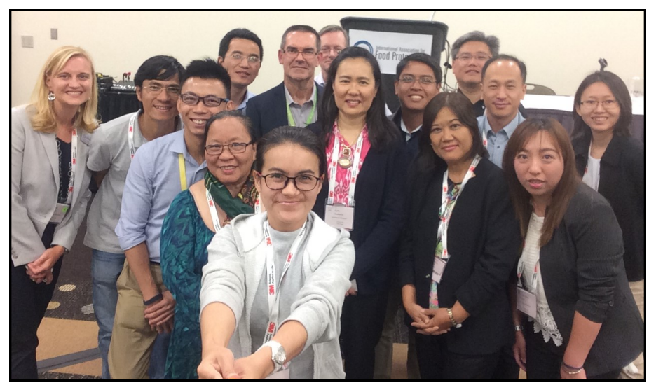
Attendees at the Southeast Asia Association for Food Protection's Annual Meeting pose for a photo following their Annual Meeting, held during IAFP 2016 .