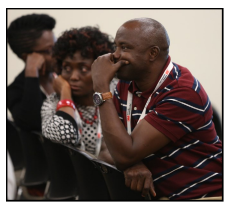
Attendees listen to topics of discussion during the AAFP Annual Meeting in St. Louis, Missouri.

some strides. Webinars are dynamic, engaging and convey information to a geographicallydispersed audience.